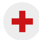
First aid / medical assistance