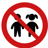
Keep away from children