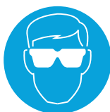
Wear safety goggles