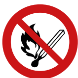
No naked flames

Store this manual in close proximity to the batteries at all times and ensure it is accessible to the relevant personnel.