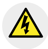
Electric shock risk

Observe the following precautions at all times